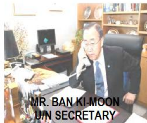
MR. BAN KI-MOON U/N SECRETARY